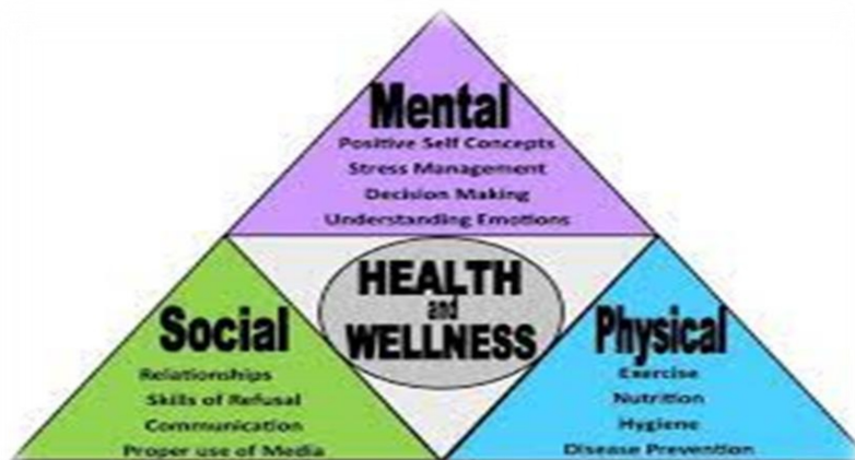
Chart for Social Mental and Physical Health

in that governments had didn't invest from collapsing beneath the pressure. Thus, the first, rather obvious lesson was that we'd like to strengthen health systems and invest in historically neglected areas, like community health and first care. Care systems were almost about brick before the pandemic, once years of asceticism and value containment. They were stretched to limit by the pandemic and had to swear nearly solely on their most significant resource: folks. It became obvious that what has been advocated by the health community for years is desperately needed: we'd like to search out ways that to recruit and retain a extremely trained and actuated men. we'd like to seem at the role of various medical examiners, of patients, and their careers, and of more and more refined technology, and choose what's the simplest thanks to give care that's alert to the requirements and expectations of patients. We have a tendency to can't merely return to doing what we have a tendency to did before.